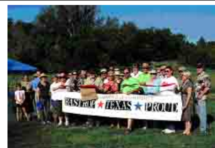
Earth Day 2009 at Lost Pines Nature Trails