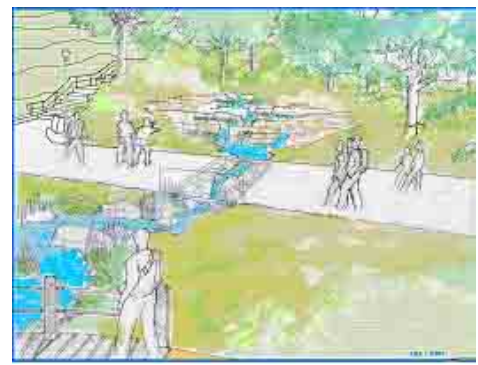
Artist's concept of restored spring, wetlands, and interpretive boardwalk.

Environmental Stewardship has organized a local stakeholder group to prepare plans for restoring the springs and to provide interpretive signage to inform the public about the historic and ecological relevance of the springs. An interpretive boardwalk with river overlook platforms will educate visitors about the Colorado River, groundwater aquifers, their ecological functions, and the relationship between these important natural resources. The group is working with Texas Parks and Wildlife and The River Studio landscape architect to develop the project.