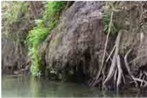
Spring that supplies water from the Carrizo-Wilcox aquifer to the Colorado River.

The focus of Environmental Stewardship's concerns has been the interaction between the Colorado River and the Carrizo-Wilcox aquifer group. Several years ago the Lower Colorado Regional Planning