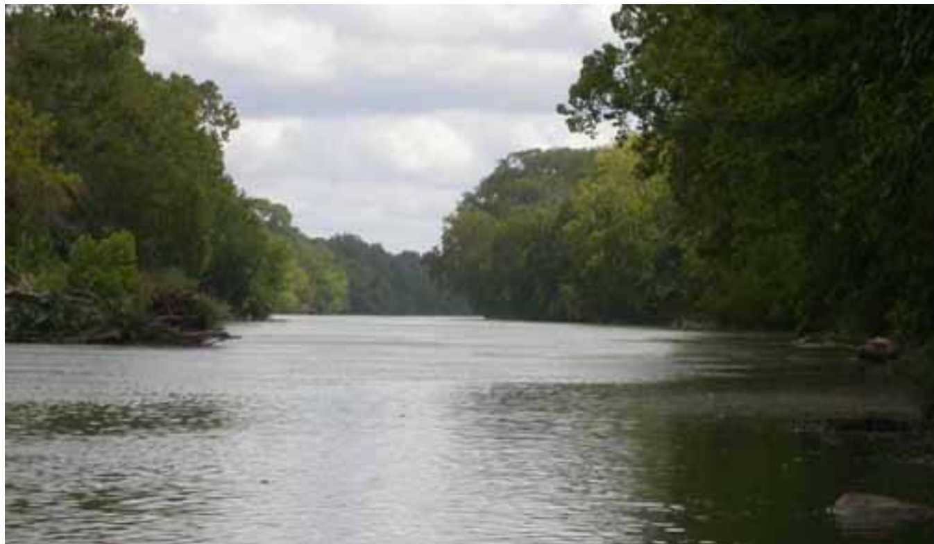
Colorado River at Pope Bend, Bastrop County, Texas